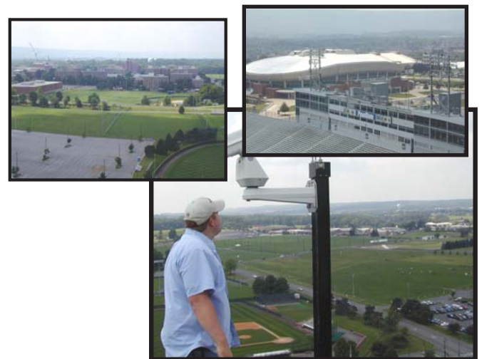
The cameras offer quite a view of the stadium, adjacent basketball field house, parking lots, surrounding roads, and other campus areas.