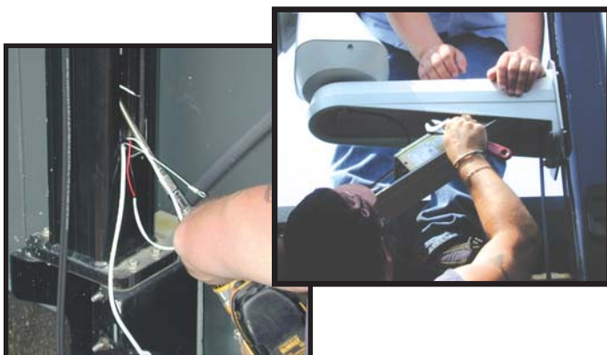
Servicing is quick and easy. The camera is lowered to the roof level with a drill. No bucket trucks or long ladders precariously placed high in the sky.

A total of four PolEvatots are at the stadium, one each on the end zone scoreboards, one on top of the luxury boxes, and one on top of the press box. The cameras are used for monitoring of the stadium and surrounding areas during games, and are also used to monitor the traffic patterns and the campus itself at all times. Monitoring is done at PSU Police headquarters.